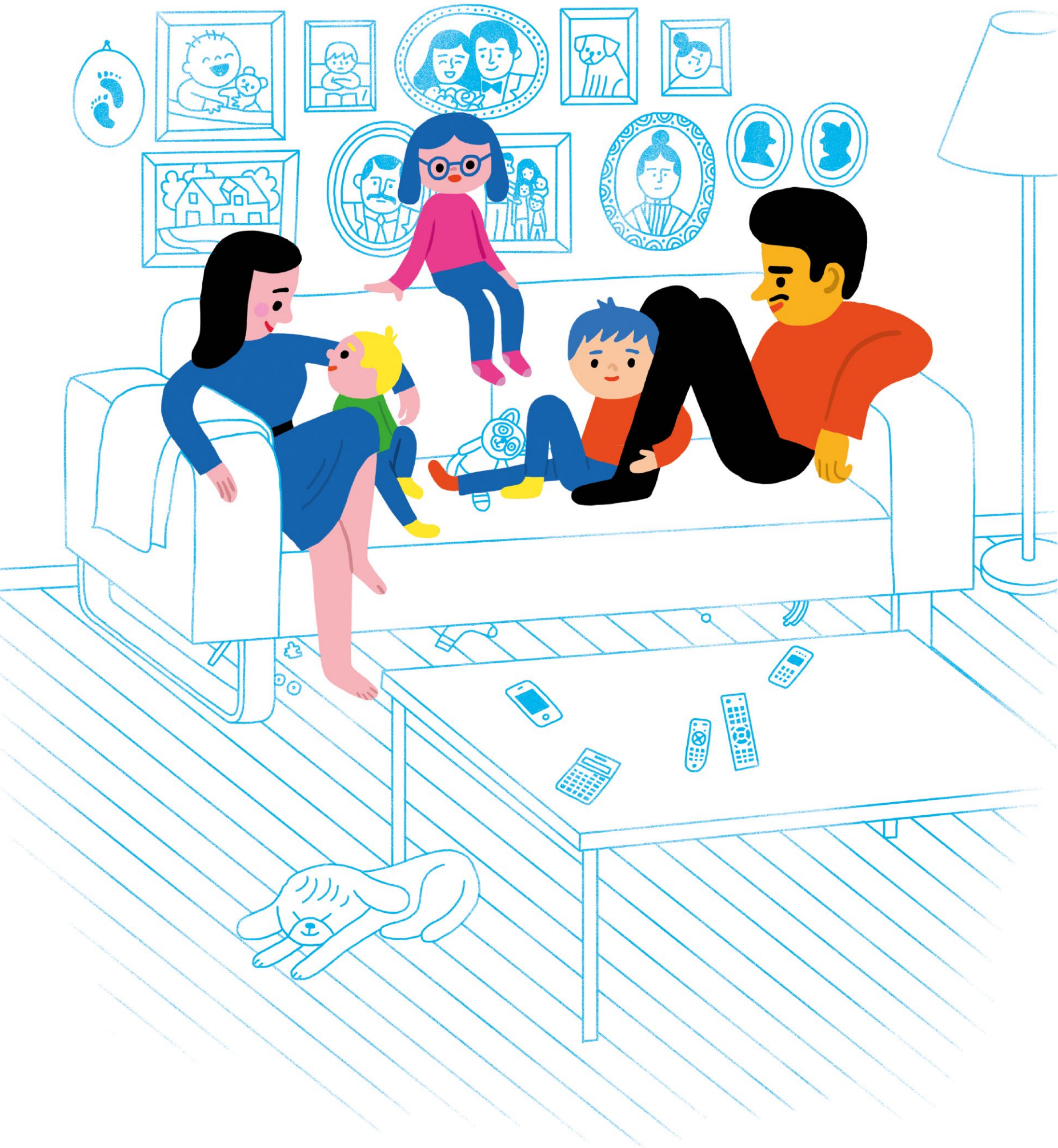
5 Five people in a family. Three of them love reading. One of them has a secret sweetheart.