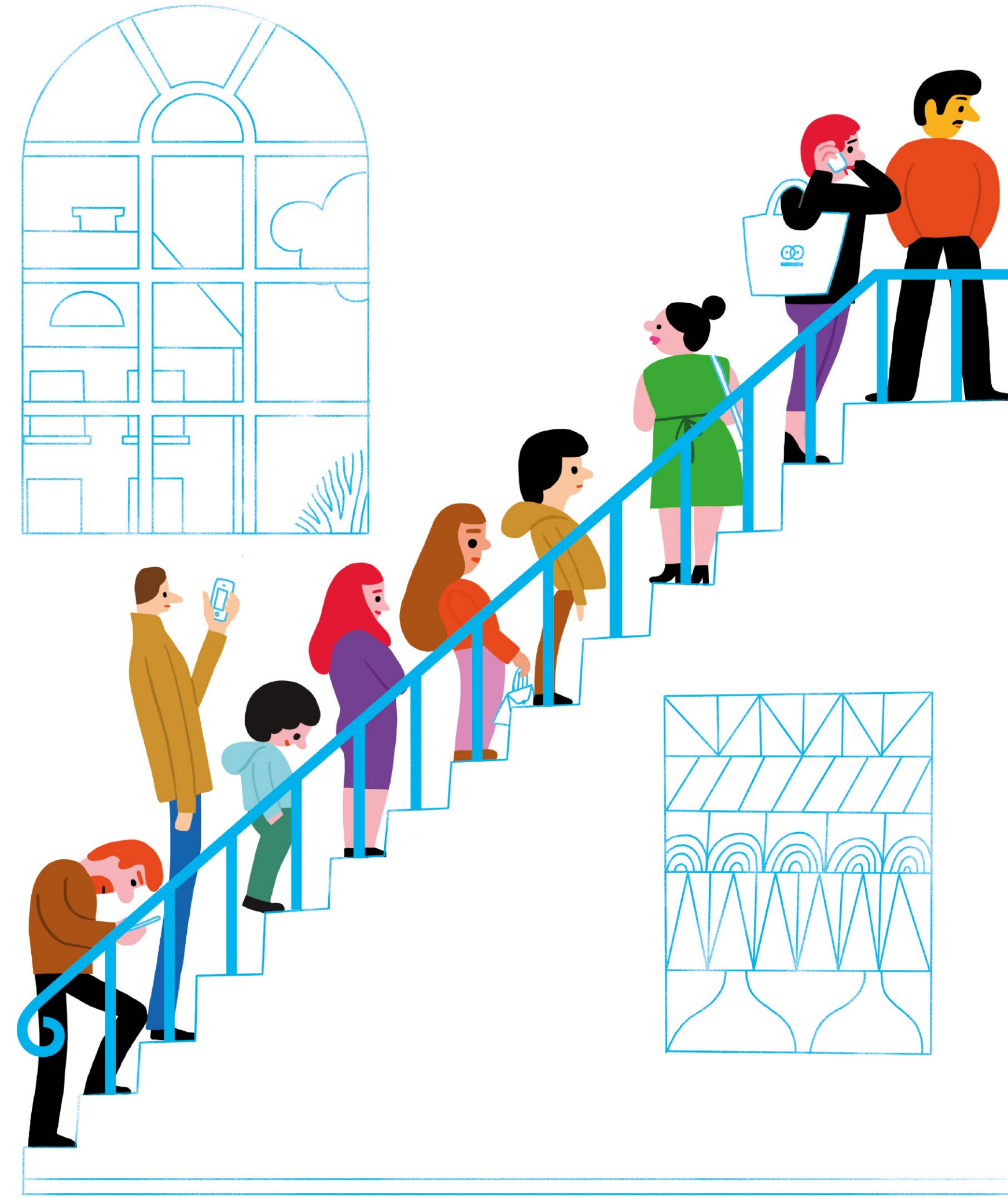
Nine people in a queue. Two of them have important decisions to make. One of them will soon be disappointed. One of them is looking forward to going to the cinema with her son.