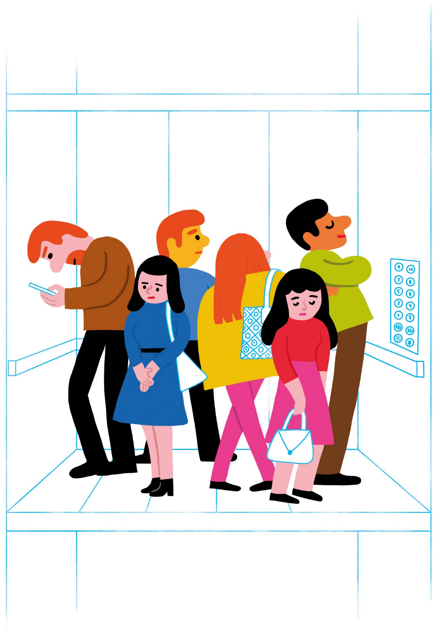
6 Six people in a lift. One of them is scared he's missing out. Two of them feel lonely.